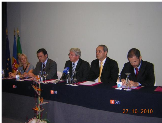
Our Press Conference, last Wednesday

During the week you will be able to go on boat trips, have the typical "espetada", "milho frito" or "filete de espada", go on tours and finally the prize-giving dinner by the pool.