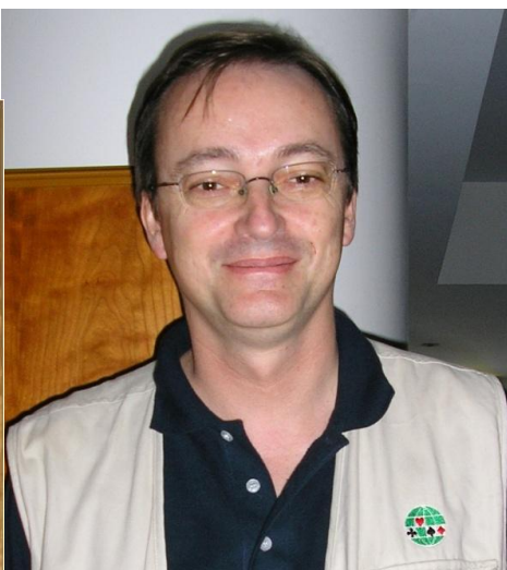
Chief Tournament Director