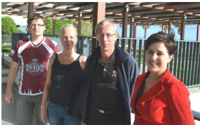
The winners – CONNIE Team

This afternoon they won all matches (16-14, 23-7 and 18-12), so, they never lost a single one!