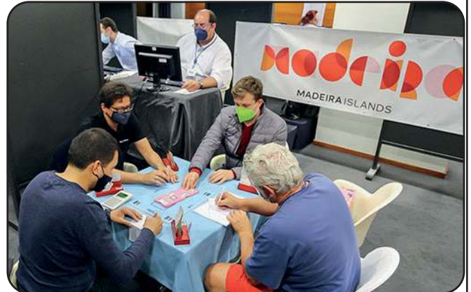
The opening match of the Open Teams being played on BBO

After two sessions Ice Jaks topped the leaderboard with 34.09 VPs while snapping at their heels is Palma , a half point behind. The third placed team, less than half a point behind, is The Maltese Falcons .