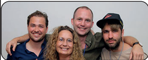
Second-Placed: Nescafe Gold