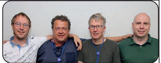
Winning Team: Alcoaça '22