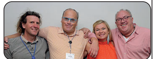
Third-Placed: Wrang Lead

The final total raised from the Charity Pairs equalled the record of two years ago: €1,500