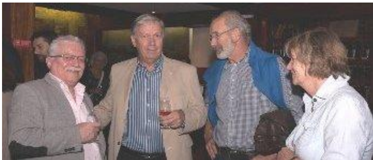
At the Welcome cocktail