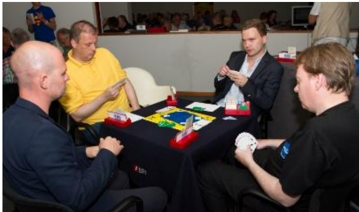
Sigdonnemann playing against Stone Cutters

Team Sigdonnemann leads the tournament. Yesterday they won all but one matches: 18.97, 18.83, 4.50, 18.04, 19.37 and 13.45. They only lost on round 6 to Stone Cutters, who are now a very close second, just 0.13