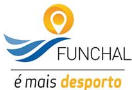
Camara Municipal do Funchal