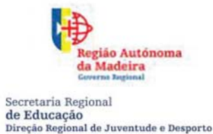
Direção Regional de Juventude e Desporto