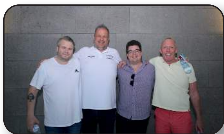
Second Don Julio