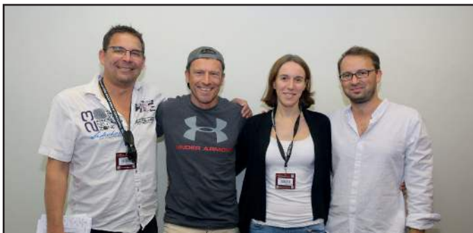
The Winning Team The Presidents